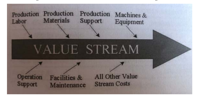
Figure 2. Costs included in value stream costing

This costing method does not use detailed data and procedures to calculate costs, but does it at the value stream level at the end of each week. Easiness, simplicity and understandability to most company employees, not just accountants is one of the characteristics of the value stream costing. Traditional costing methods pay a lot of attention to the selection of adequate bases for the allocation of overhead costs to cost objects. The choice of inappropriate keys for allocating the increased mass of overhead costs to cost objects lead to the presentation of distorted information on product costs. Some products are burdened with higher or lower overheads than they actually caused. The situation is somewhat different in value stream costing. All costs in the value stream are considered direct. The information necessary to calculate the value stream profit is collected on a weekly basis, linking all overheads to the value stream as a whole, without the need to use labor hours as the basis for allocation. The costs included in value stream costing are shown in Figure 2.